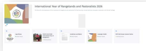
Digital Media Hub