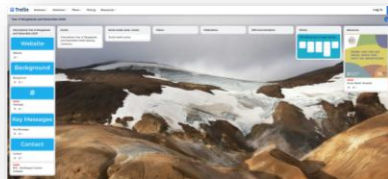
IYRP Trello board