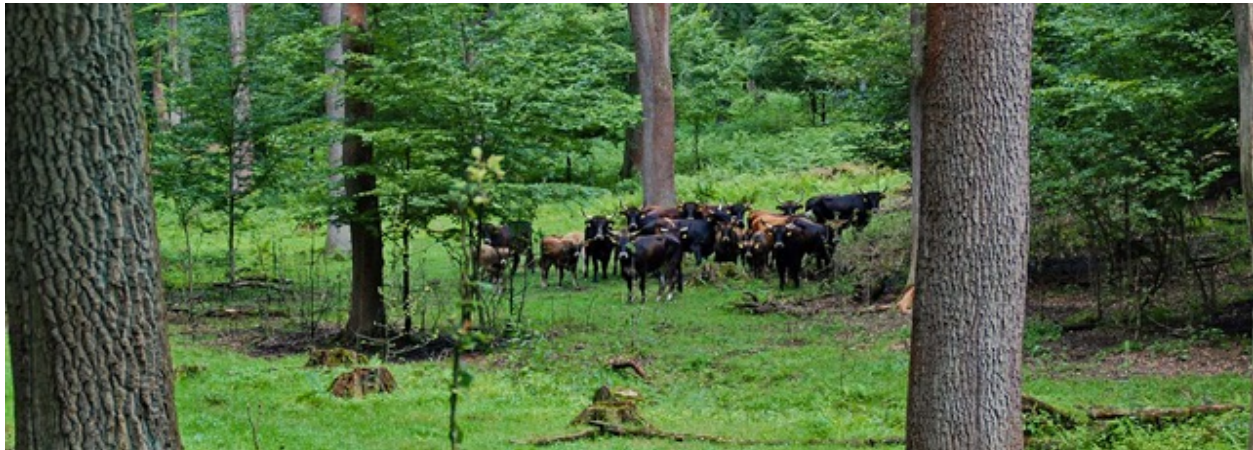
Hutewald (pastoral forest) Solling, an excursion site

The meeting will also provide ample opportunities for informal exchanges creating a welcoming environment for networking, collaboration and friendship. We invite you to join us for a weekend of reflection and learning as we explore how rangelands and pastoralism continue to contribute to resilient landscapes and sustainable livelihoods around the world.