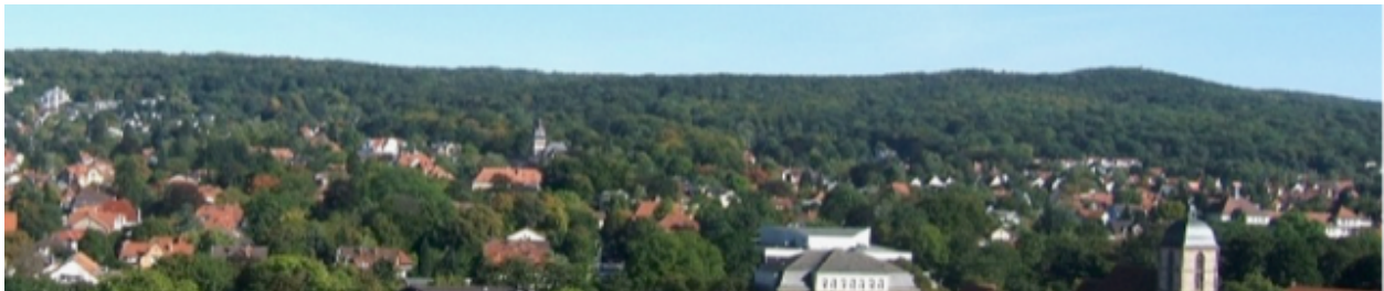
Göttingen Ostviertel (East Quarter), where the youth hostel is located

DJH Jugendherberge Göttingen Habichtsweg 2, 37075 Göttingen Website: https://www.jugendherberge.de/jugendherbergen/goettingen Tel. 0551-57622 Email goettingen@jugendherberge.de