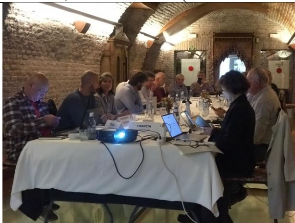
Photo 2 : meeting Room in Madrid, where representatives of the Min of Ecological Transition of Spain, of 12 European countries, plus Mongolia, and 2 IYRP representatives, working on TRE (Terre Rurali d'Europa) Programme and Common Safeguarding Plans as well as on the possibility of a third wave of Nomination of Transhumance World Immaterial Cultural Heritage