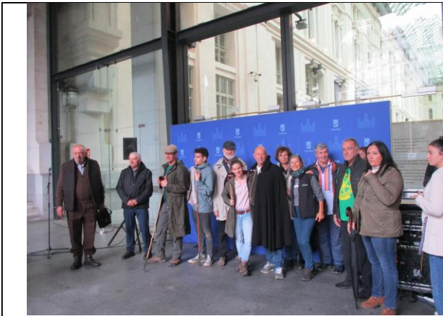
Photo 16: The International group participating in the ceremony of the Mayor and the Shepherd in the entrance of the town hall of Madrid (23-10-2022)