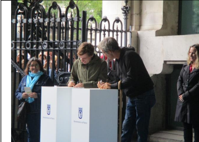
Photo 18: Mayor of Madrid and Chief Shepherd (of the Transhumance Flock of Concejo de la Mesta) signing the agreement, for the payment of the 50 "maravedies" for each 1000 sheep crossing the city of Madrid (23-10-2022) honouring a 1418 agreement with the city's council where the price of 50 "maravedís al millar" (50 middle age coins per thousand heads of livestock) was set for the safe passage of the animals.