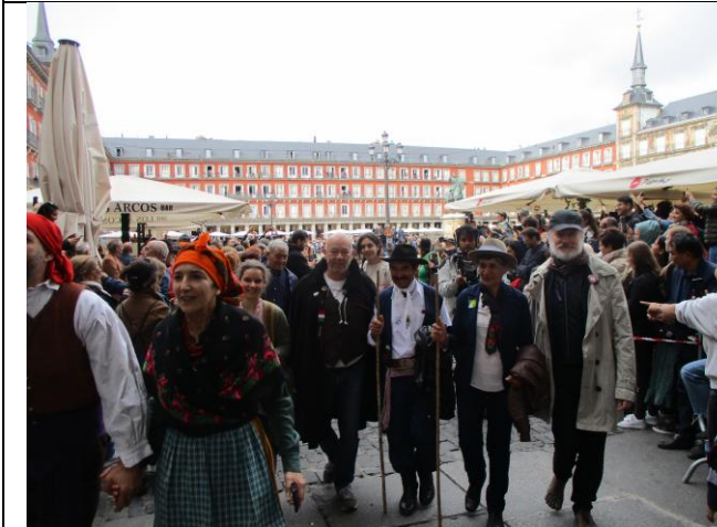
Photo 12: International Delegation behind the shepherds of León (Spain) in gala dress, and walking in front of the flock, crossing Plaza Mayor of Madrid (23-10-2022)