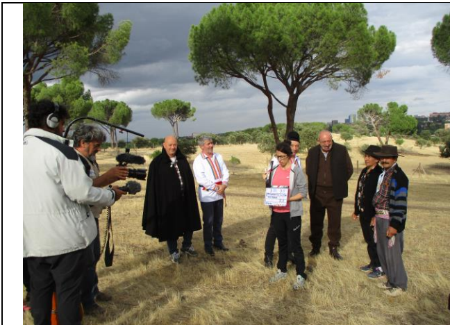
Photo 10: Preparation of a common film on Pastoralism in the framework of a Common Safeguard Plan of Transhumance and Pastoralism for IYRP