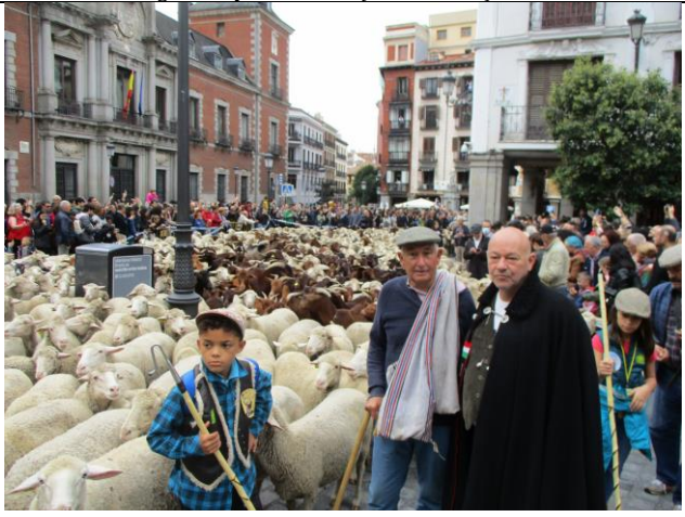
Photo 13: Flock of 1200 sheep and 200 goats crossing Madrid, with their shepherds, also with young generation (23-10-2022)