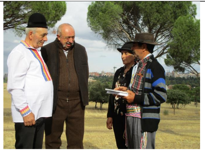
Photo 9: Argentinian and Rumanian transhuming livestock keeper sharing experiences and presents