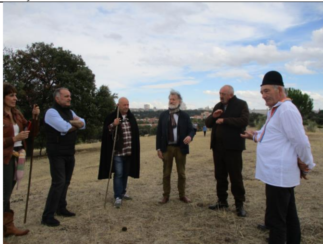
Photo 8: Rumanian shepherd in the Dehesa of Casa de Campo, talking with Spanish veterinary. Madrid can be seen in the back (22-10-2022)