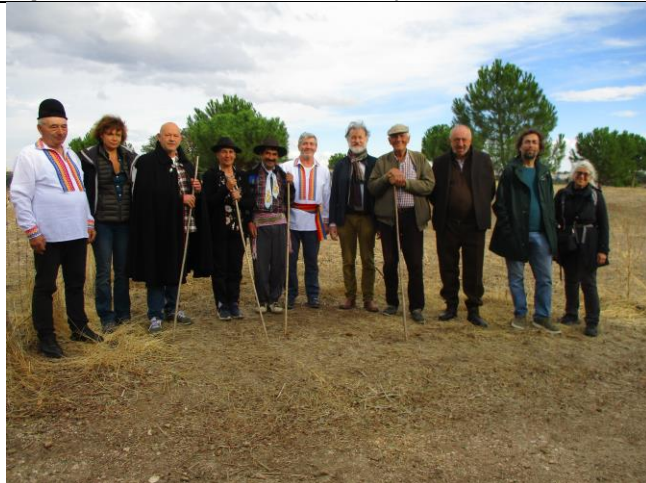
Photo 8: Shepherds & Pastoralism experts from Spain, Argentina, Rumania, France, Italy, Luxembourg & IYRP representatives, discussing International Pastoralism issues (Casa de Campo-Madrid-Spain (22-10-2022)