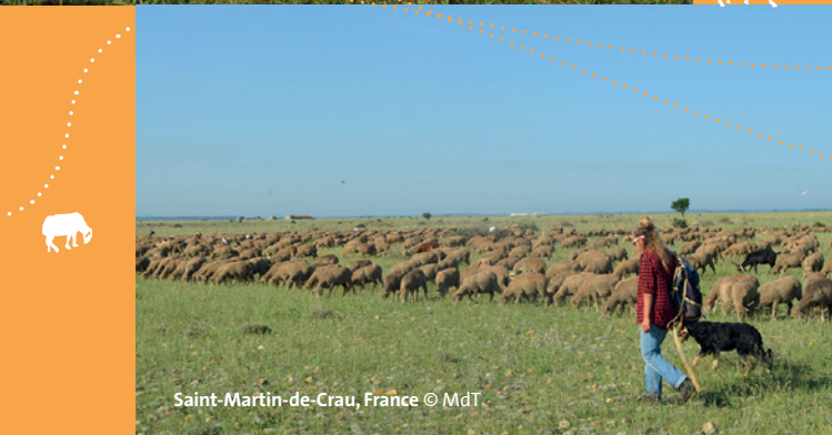
Saint-Martin-de-Crau, France