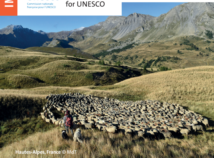
Hautes-Alpes, France

Under the patronage of the French National Commission for UNESCO