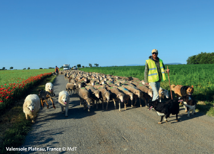
Valensole Plateau, France

French-English translation provided over the entire 3 days