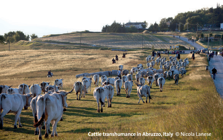
Cattle transhumance in Abruzzo, Italy