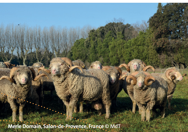
Merle Domain, Salon-de-Provence, France

Return by coach to Marseille - Estimated arrival 5.30 p.m.