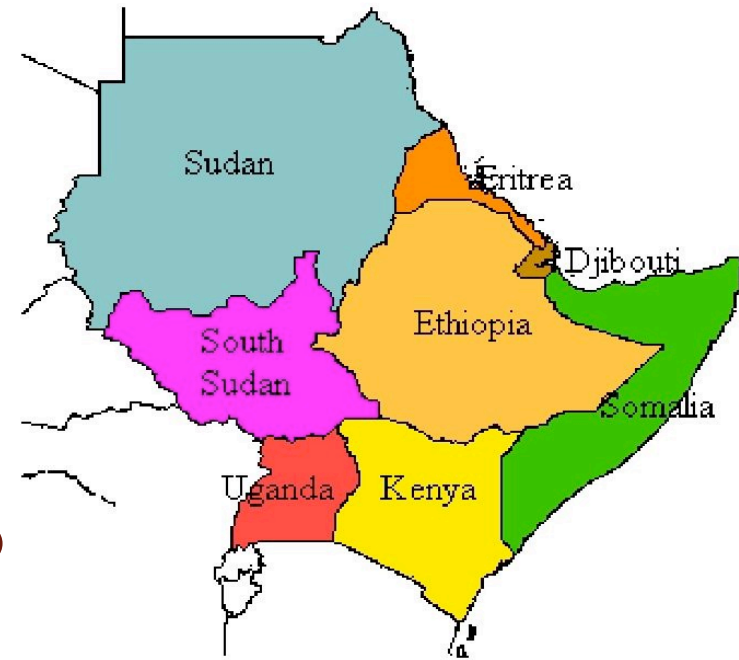
IGAD Member States