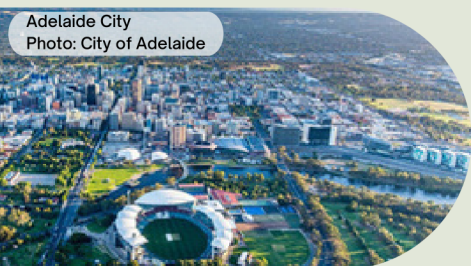
Adelaide City