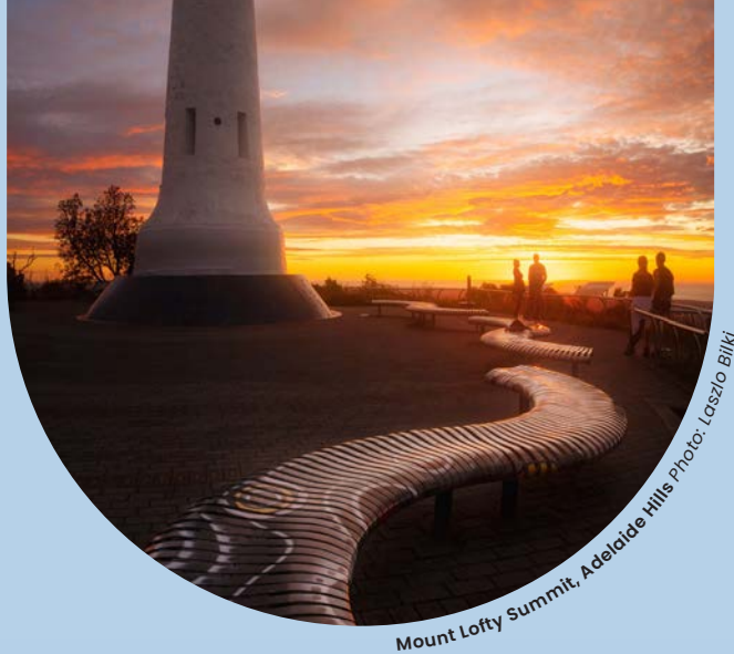
Mount Lofty Summit, Adelaide Hills