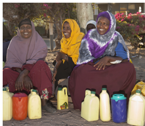
Selling milk in Isiolo, Kenya